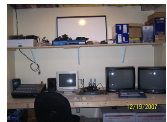
'A Better Life' control room. God is Faithful!