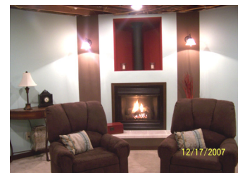
Our main set is finished! Praise the Lord!